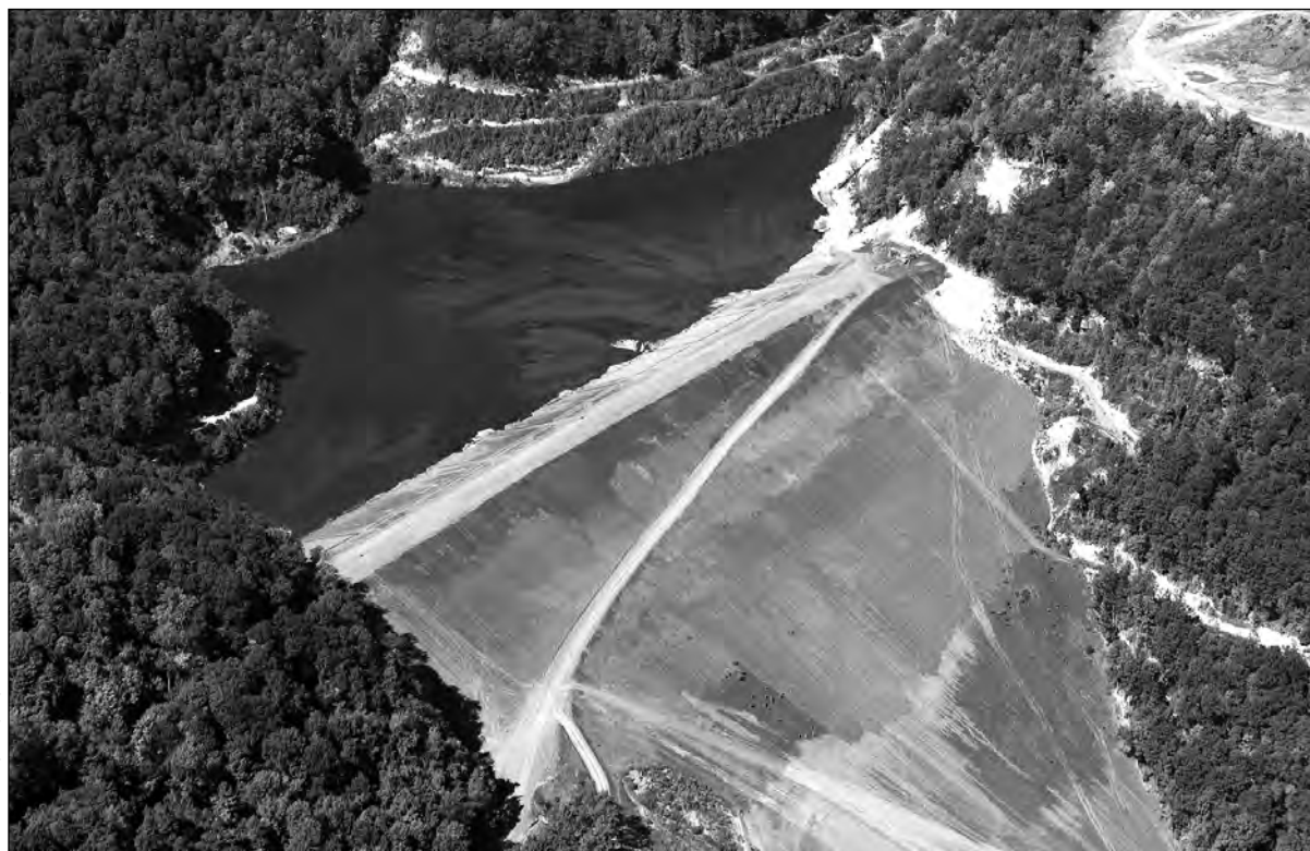
Mountaintop removal—a coal sludge pond near Middlesboro—in Bell County, Kentucky.

Dave Cooper ( http://www.mountaintopremoval.com )