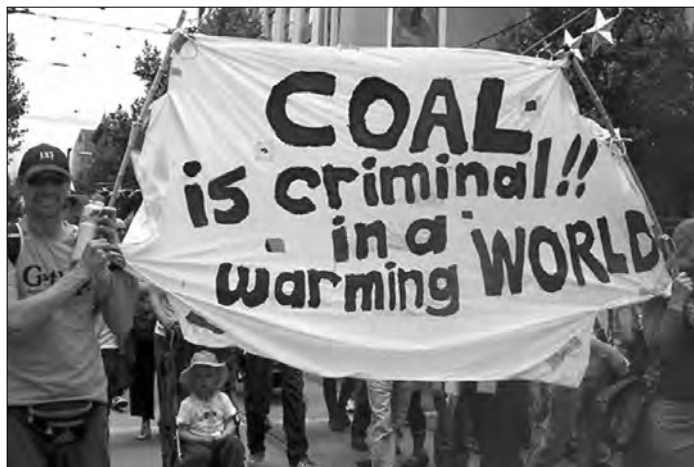
Protesters at Melbourne Walk Against Warming, Dec. 12, 2009.

Coal is hidden—in the curriculum, but also literally: We encounter coal every time we turn on a light, but—at least in urban areas—our students almost never see it. I wanted to begin our brief introduction to coal by showing some of the stuff to students, but it was almost impossible to find. I sent an email to the 60 teachers on our Earth in Crisis curriculum list asking if anyone had any coal. No luck. So I called Portland General Electric, which runs Oregon's only coal-fired power plant, in eastern Oregon. PGE promised to send me some coal but never did. Finally, I called several coal companies around the country and left messages. A few days later a package postmarked St. Louis arrived from