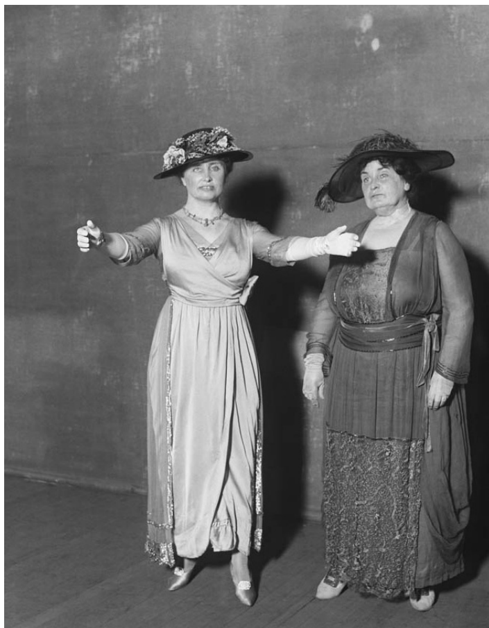
Helen Keller was a tireless advocate for workers' rights. This photo from 1919 shows Keller, accompanied by Anne Sullivan Macy, addressing a gathering of striking actors in New York.