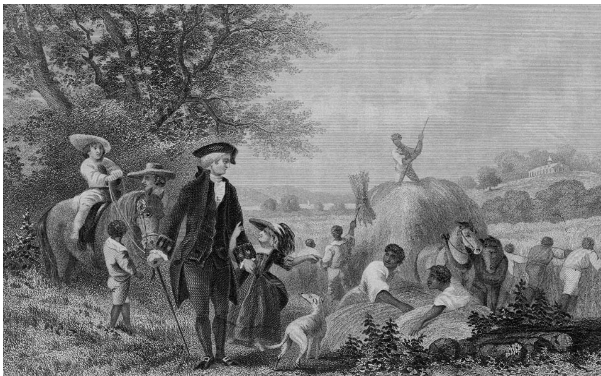
President George Washington watches over a group of black slaves working in a field at Mount Vernon.