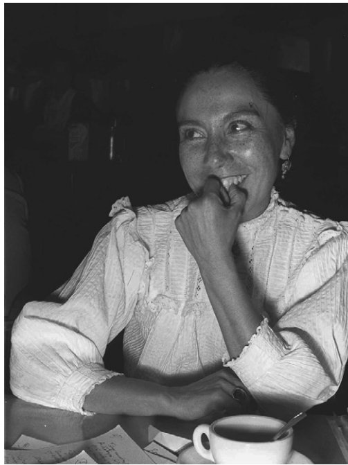
Rosaura Revueltas, who played Esperanza in the movie Salt of the Earth , in 1956.

The history of the film is as compelling as its story, because the making of the film itself stands as an example of resistance. Excerpts from the book Salt of the Earth could be a valuable supplement to showing the film. The book includes interviews and stories about the making of the film. That the government viewed the making of the movie as dangerous both amused and alarmed my students, who saw possible parallels