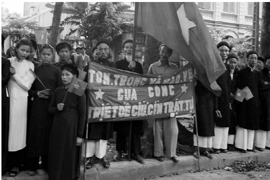
Citizens of Hanoi, Vietnam, at a victory parade in October of 1954, after peace talks at Geneva led to the withdrawal of French colonial forces from all of Indochina. The United States had supported the French during the war.

a stop to the suffering—including U.S. soldiers themselves. And students should be encouraged to reflect deeply on which strategies for peace were most effective. Howard Zinn movingly describes this widespread opposition to the war in Chapter 18 of A People’s History of the United States .