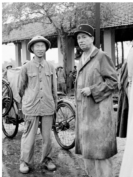
Viet Minh and French officer in Hanoi, October 12, 1954. Following the Geneva Accords, the French withdrew from Vietnam.

explore the personal dimensions of diplomacy and political economy. And no study of the war would be complete without examining the dynamics of the massive movement to end that war. [The best film for this is Sir! No Sir! , available from www.teachingforchange.org , which looks at the antiwar movement within the U.S. military.] Especially when confronted with the horrifying images of slaughtered children in a film like Remember My Lai , the chilling sobs of a young Vietnamese boy whose father has been killed, in Hearts and Minds , or the anguish of American and Vietnamese women in Regret to Inform , our students need to know that millions of people tried to put