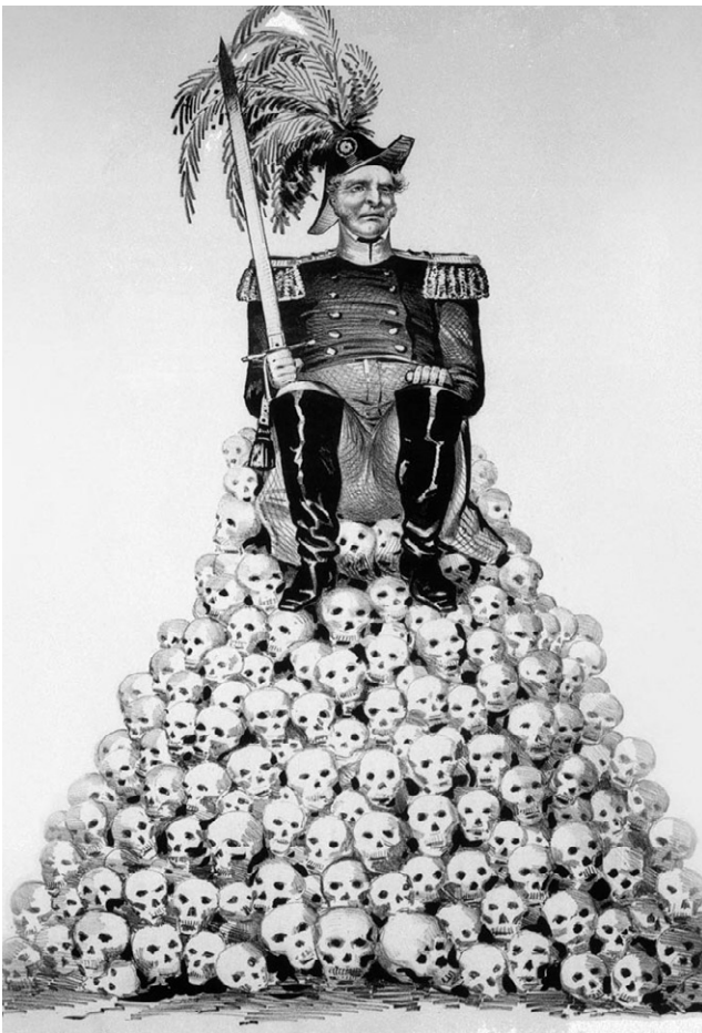
Presidential candidate Gen. Zachary Taylor sits atop a mound of skulls in this 1848 cartoon criticizing his role in the U.S. war against Mexico.