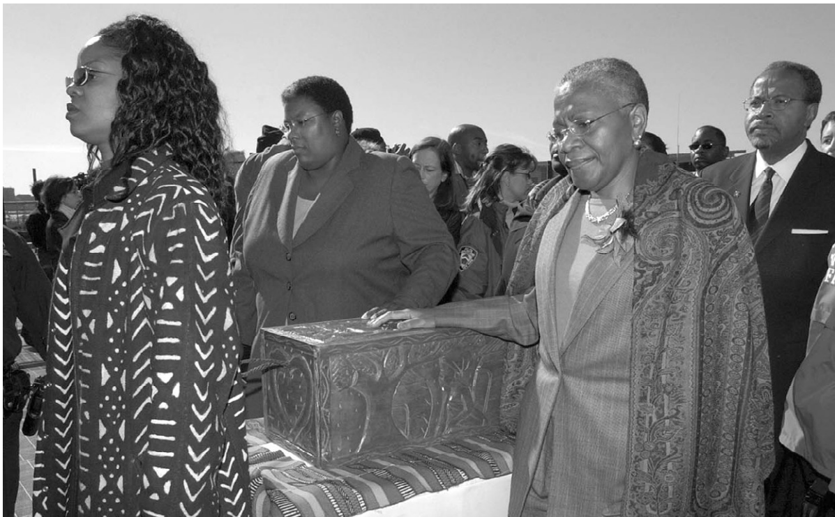
Pallbearers carry a coffin containing the remains of free and enslaved African Americans during a reburial ceremony in October 2003. Construction workers discovered the remains in 1991 when excavating a site for a new building in Manhattan.